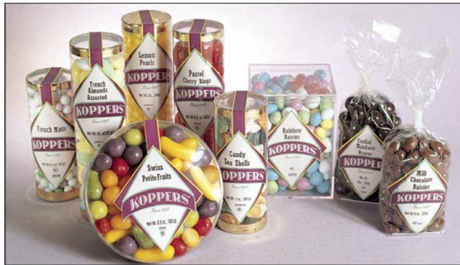
Sweet orders for MAS 90

A favorite feature of the MAS 90 for Windows software at Koppers is the ability to email and fax invoices, something their customers