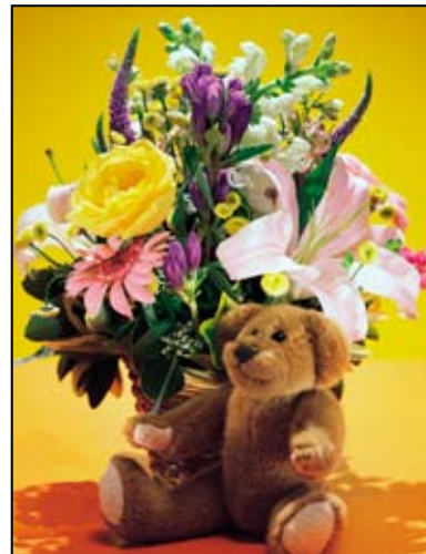
Companies that assemble several items into a package for resale also can benefit from the Bill of Materials module.

The multiple available options for a bill can present some special situations. For example, the choice of a particular option may require you to